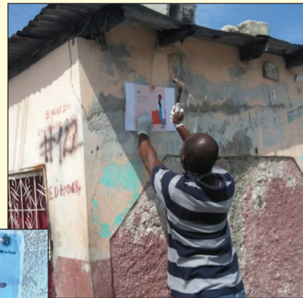
Sharing information to keep residents updated through the crisis (by poster, by megaphone and even online).