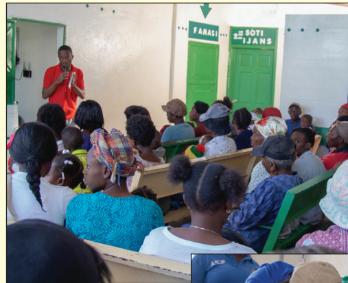
Increased preventive health demonstrations to educate the community about COVID-19.