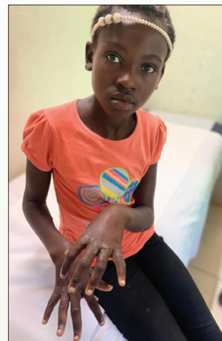
Young girl seen at clinic for skin ailment

To answer my own question, then, a resounding NO, we oughtn't give up. Life is harsh, at times brutally challenging, in Haiti right now, most especially in Cité Soleil. But for 17 years Lamp for Haiti has not wavered. We remain