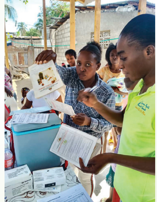
Vaccination clinic near Cité Soleil

My best to you and your family at this beautiful time of year.