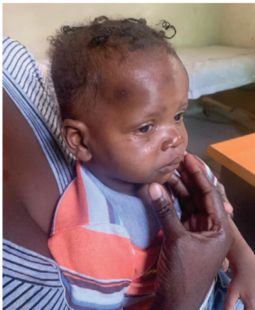
Mother shows off her now-healthy girl

These principles are key to who we are and the work we do. It is this core that has made it possible to continue for 17 years,