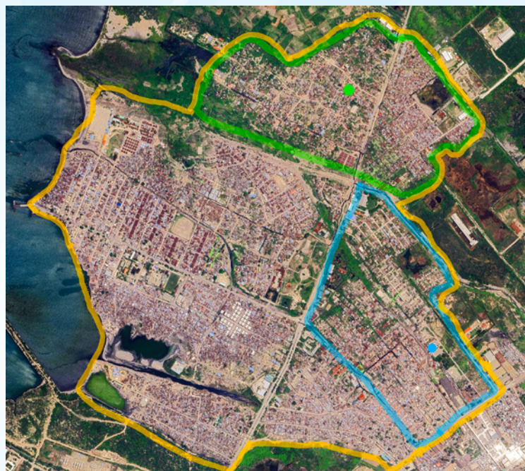
The shanty town of Cité Soleil (yellow). Lamp's traditional service community (green). The green dot is the Lamp for Haiti Health Center. Our new population (blue). The blue dot is our partner, Sakala.

the international airport) as gangs tried, successfully, to keep President Ariel Henry from returning to the country. When we re-opened in early May, we made another momentous decision: to accept patients from a large new area within Cité Soleil. In partnership with youth organization Sakala, which is located there, we are now accepting patients from neighborhoods called Twa Bebe (Three Babies), Limyè (Light), and De Site (Two Cities) (See Map).