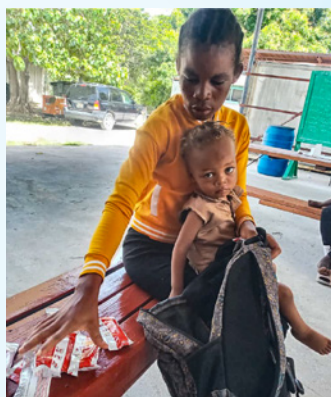
The child nutrition program has exploded due to the desperate conditions in Port-au-Prince

A second way in which Lamp has pushed forward is reflected in the theme statement of our gala this year: Extending our Reach, Expanding our Family. Late last year we took an ambitious step and opened a second health care location. The first six months saw many disruptions in service, and in March a full scale conflict broke out in the area (near